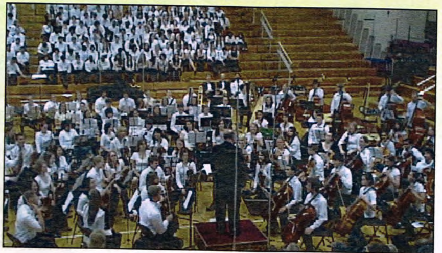
The Awesome Scope of the Fox Valley Orchestra!

The finale of the concert consisted of a combined performance of Battle Hymn of The Republic .