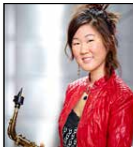
Grace Kelly, Boston