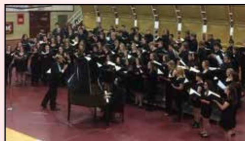
NIB XII Choir Students