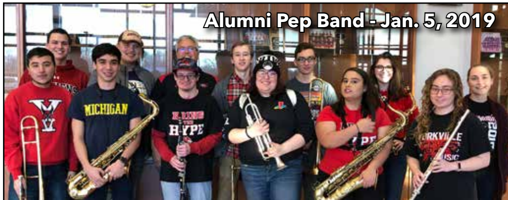
Alumni Pep Band - Jan. 5, 2019