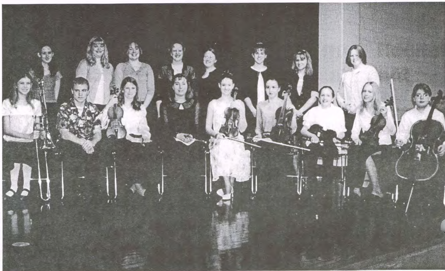
2001 Student Honors Recital

The Yorkville Music Boosters' Student Honors Recital was held in the YHS Cafetorium on Sunday, March 25, 2001. Seventeen students were selected by audition to perform in this year's recital.