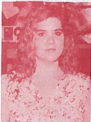
Nicole Krips National School Orchestra Award