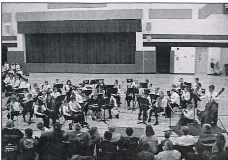
Fourth Grade Orchestra