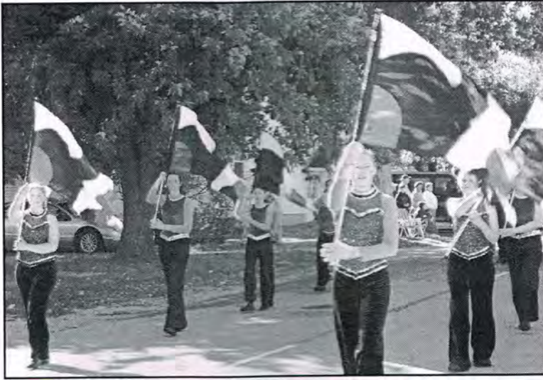
YHS Color Guard

The YHS Color Guard held it's first Flag Mini-Camp. The event turned into a spectacular show for Homecoming. The camp attracted approximately 30 students in grades 4 - 8. The mini-camp included two days of rehearsal and a performance during the Homecoming pre-game. If you know anyone interested in participating in future flag mini-camps, look for information next fall.