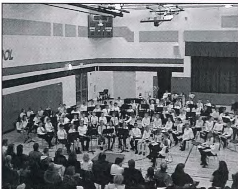
Fourth Grade Band