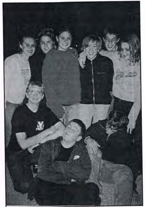
YHS Band Members Bonding