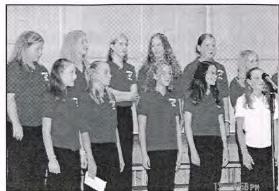
Eighth Grade Choir