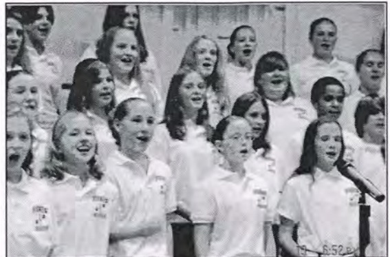
Seventh Grade Choir