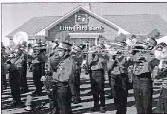
The Marching Foxes playing at the grand opening of the Yorkville Fifth Third Bank