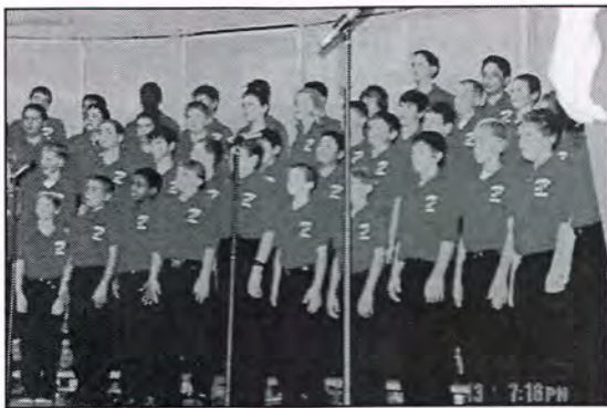
Eighth Grade Choir

I thank you for your support, and remind you that YOU are a key ingredient in our success recipe.