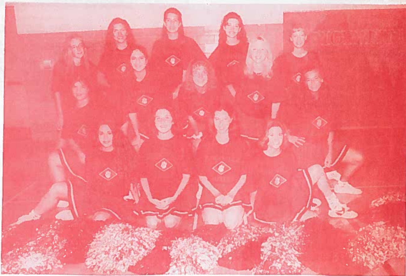
YHS Pom Pon Squad