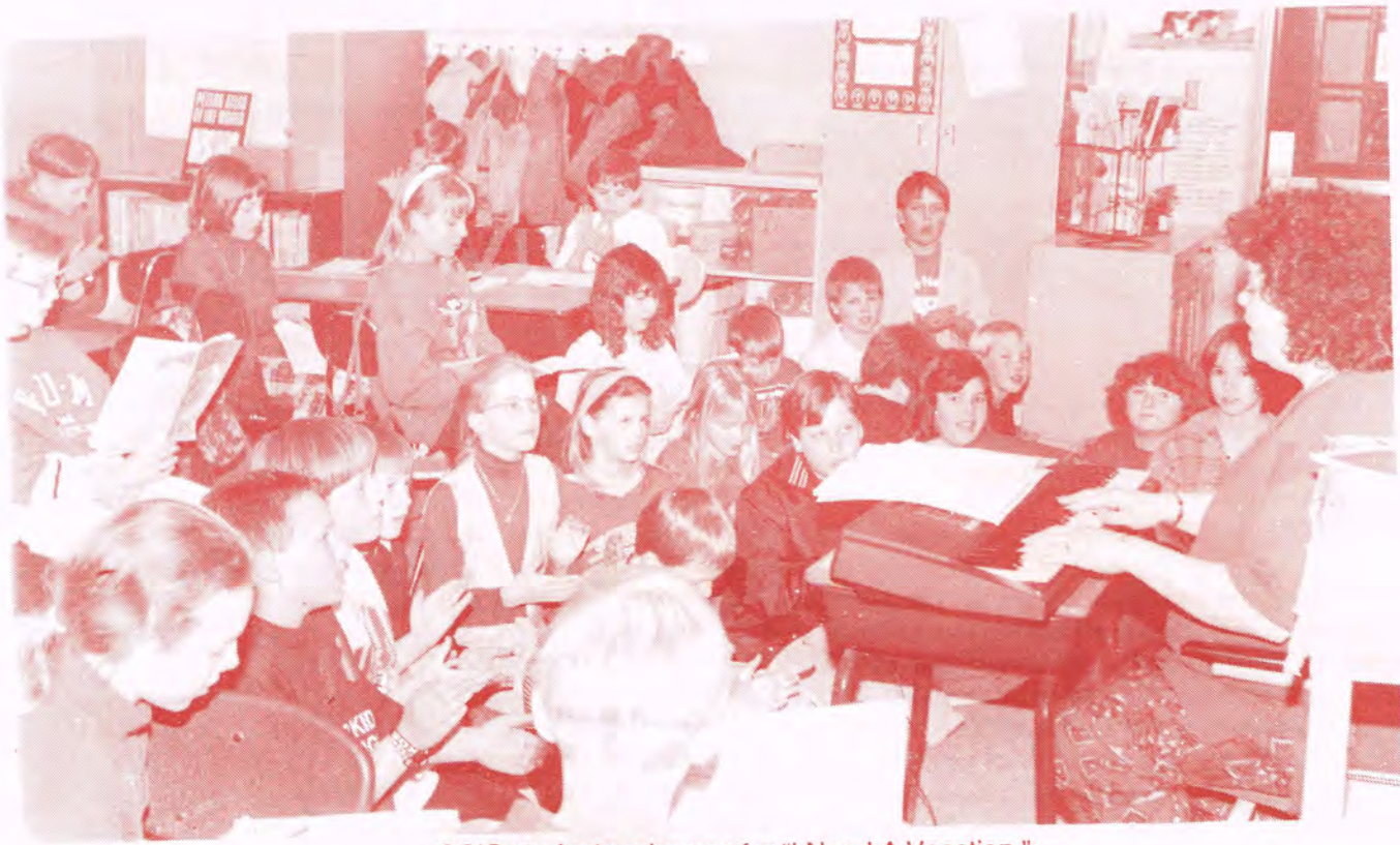
CCIS students rehearse for "I Need A Vacation."