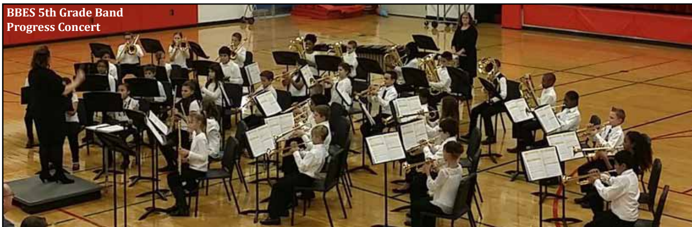
BBES 5th Grade Band Progress Concert

A new crop of young and energetic 5th grade musicians started their journey in the band program this past fall! Here is what some students at YIS are saying about 5th grade band: