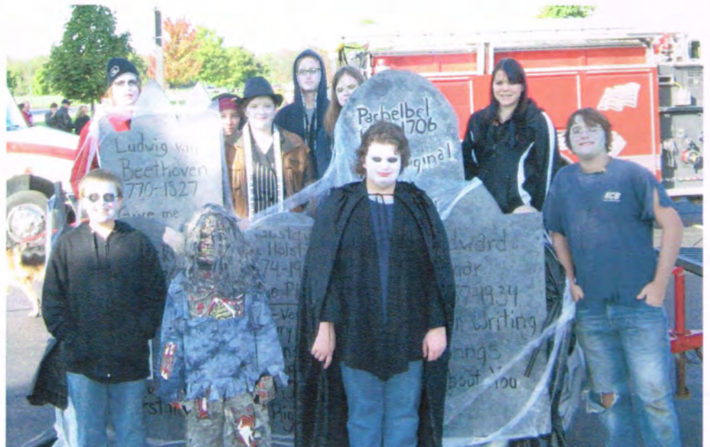
Orchestra Homecoming Float 2009