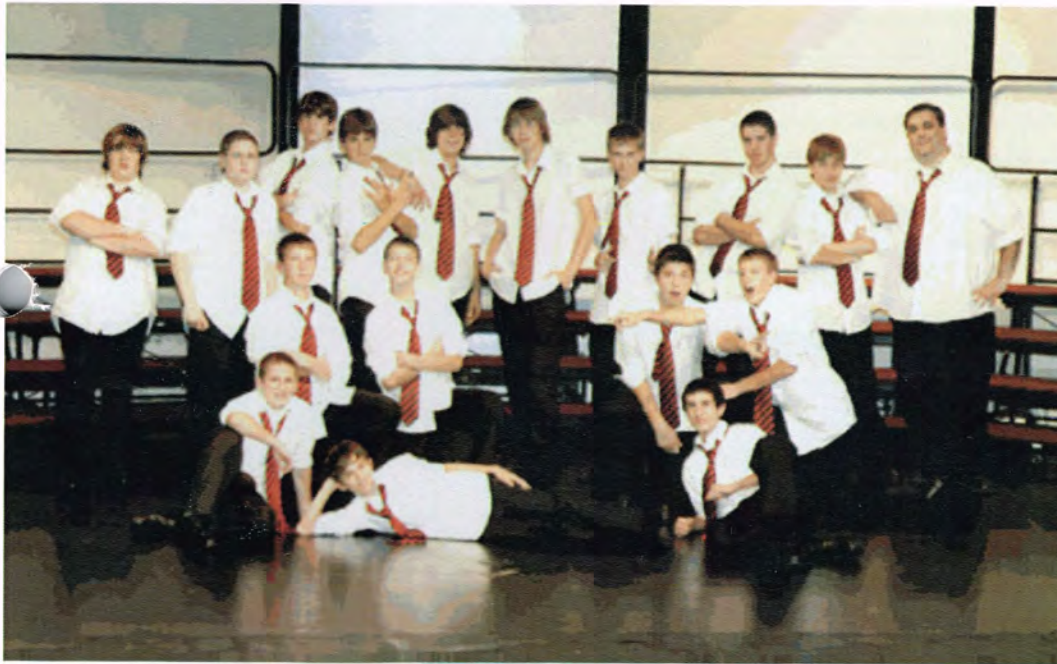
Pictured above is "Pojjat", which is a word from Finland which means, simply: "The Guys".