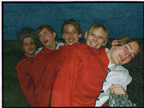
The girls of the front ensemble having some fun while waiting for their performance time. The Marching Foxes had a lot of time for bonding this fall during their