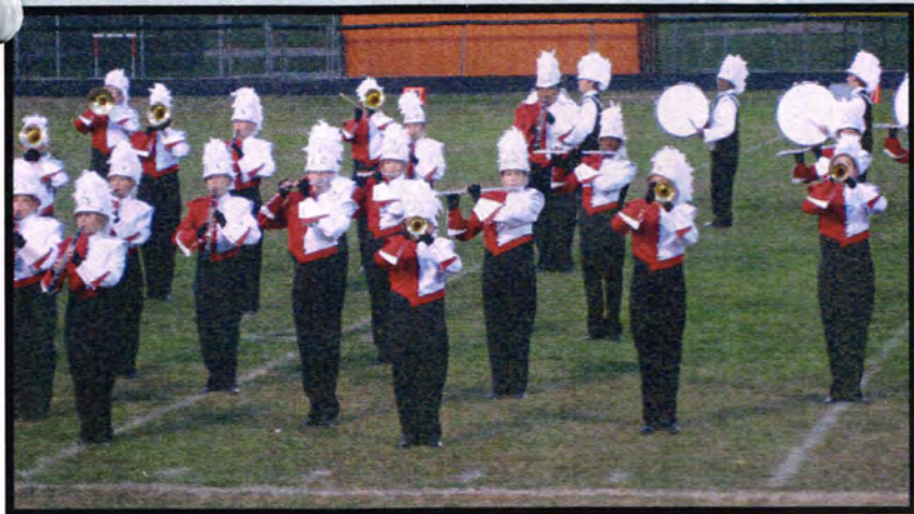
The Marching Foxes perform their field show at Sandwich High School in the Renegade Marching