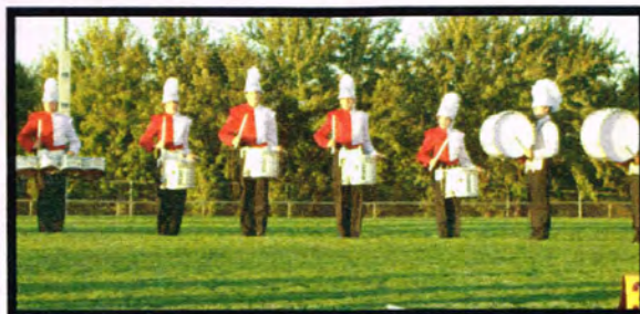
The YHS drumline gets one last warm-up before performance.