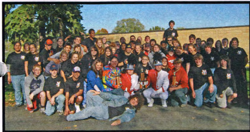
A group photo after the 1.5 mile Sycamore Pumpkin Festival Parade.