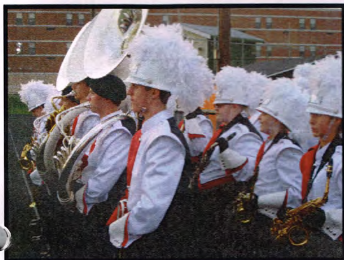
The Marching Foxes lined up on the back sideline ready to take the field in competition.